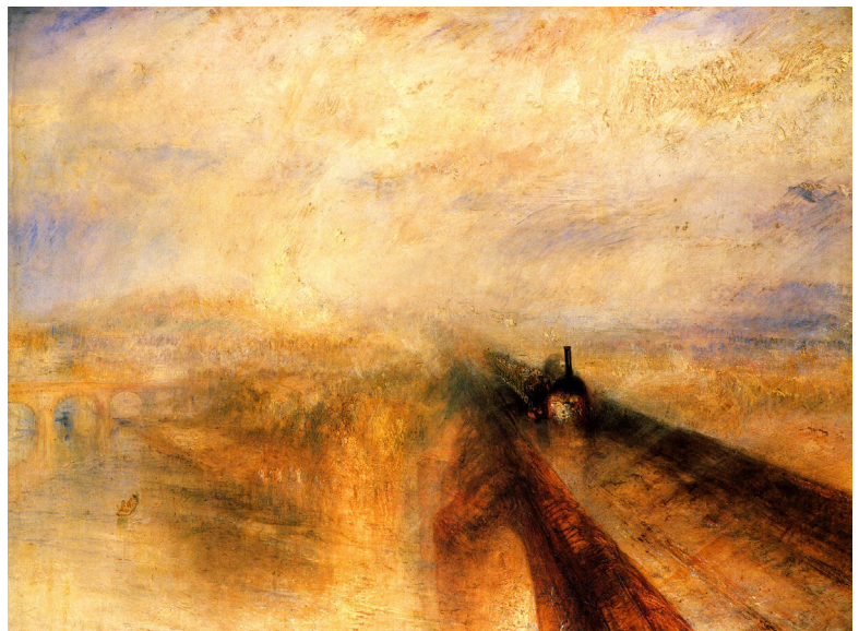
Rain Steam and Speed the Great Western Railway J. M. W. Turner