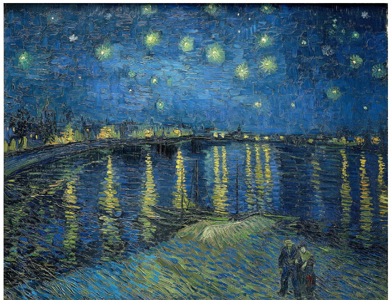
Starry Night Over the Rhone Vincent Van Gogh